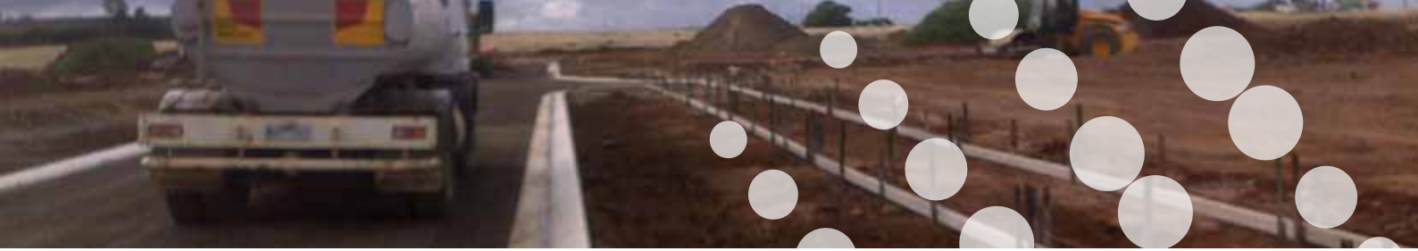
The Ridge, Tarneit – Stage One Landscape Plan